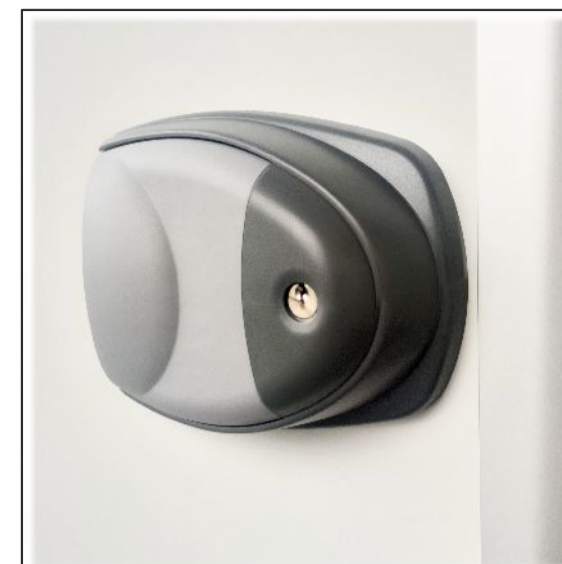
1. Coldroom ext. lock