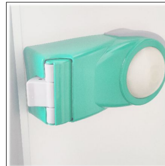
2. Coldroom int. lock