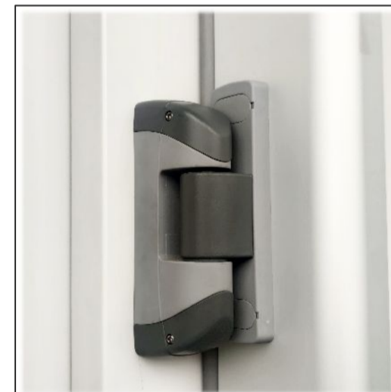
3. Rising Hinges